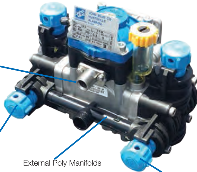
External Poly Manifolds